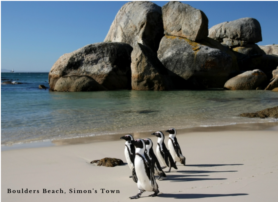
Boulders Beach, Simon's Town