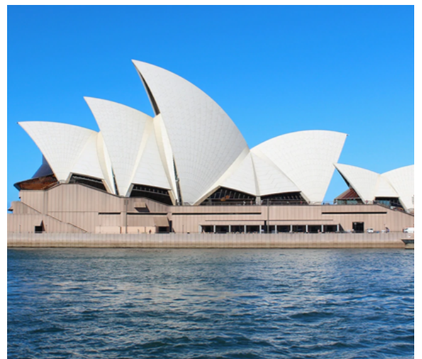
Kaiser Woodland PFO Read-A-Thon

National Parks: Australia has 516 national parks to protect its unique plants and animals. There are also several types of rain forests - tropical rain forests, mainly found in the northeast, are the richest in plant and animal species. Subtropical rain forests are found near the mid-eastern coast, and broadleaf rain forests grow in the southeast and on the island of Tasmania. Sydney, Australia